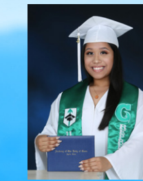
Pristine Tapao Academy of Our Lady of Guam